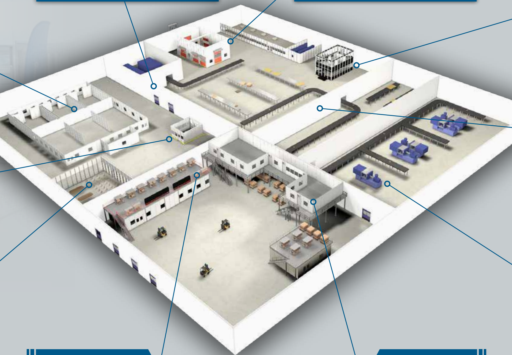
Walls beneath Mezzanine