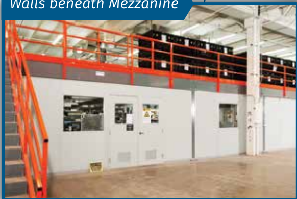
Walls beneath Mezzanine