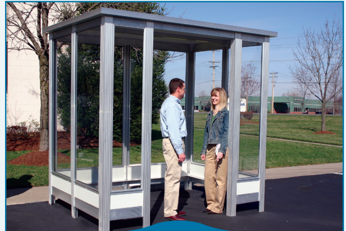
PortaFab shelters come fully assembled and ready for instant use