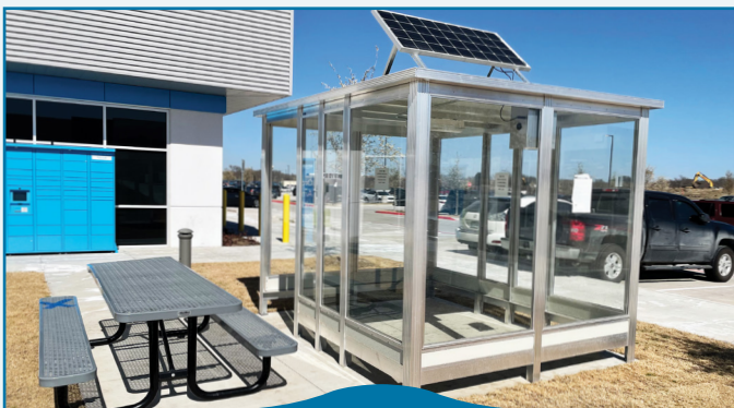
Smoking shelter with solar panels